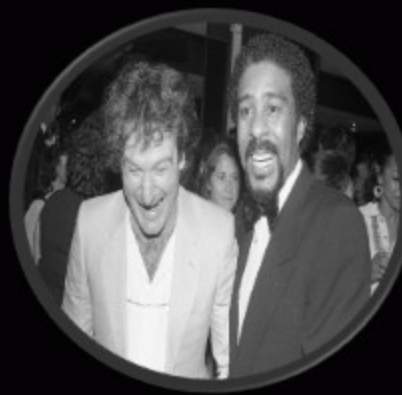
Richard Pryor Robin Williams