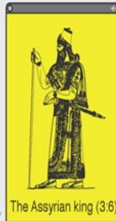
The Assyrian king (3:6)