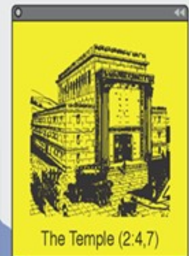
The Temple (2:4,7)

Directions Search nearby Save to... move▼