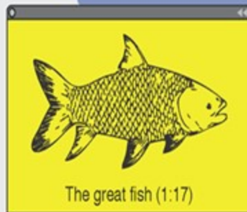
The great fish (1:17)

Directions Search nearby Save to... move▼